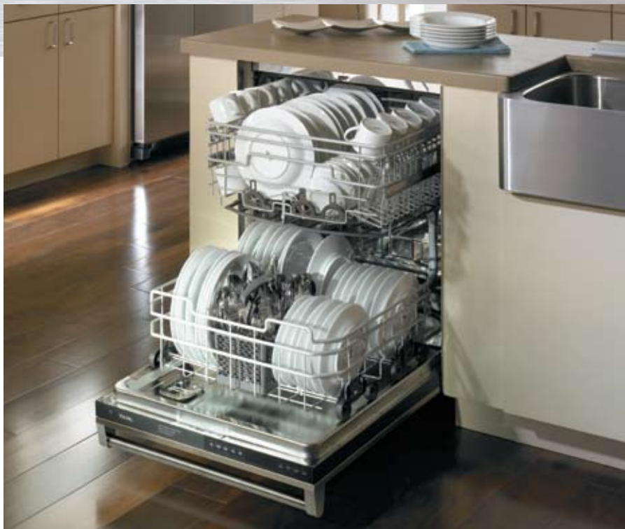
The "Load-As-You-Like" Versa-Load™ racks are highly functional and a pleasure to operate.