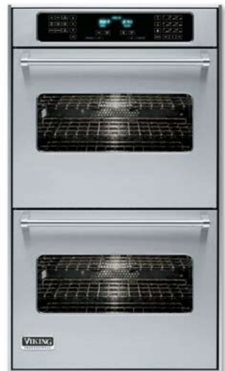
30"W. Professional Ultra-Premier Select Touch Control Electric Double Oven

This is just one of many examples of how an artful, stylish selection of Viking oven products can help transform every kitchen to a design gallery of oven options with ultra-premium features, cooking power and control that would be the envy of any chef. Whatever your client's needs, there is a Viking oven solution that is perfect for you.