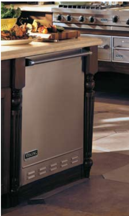
Viking Professional Intelli-Wash™ Dishwasher is available with two different Professional door styles, one with louvers and one without.

The Vari-Pressure Intelli-Wash™ System adjusts water volumes and water pressure. An exclusive variable speed, ½ horsepower, commercial-type motor provides the power to get the job done. Other features include: