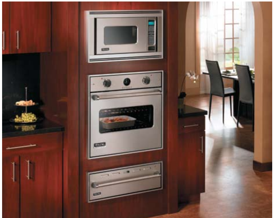
30"W. Professional Ultra-Premier Premier Electric Single Oven (shown with built-in microwave/trim kit and 30"W. warming drawer)