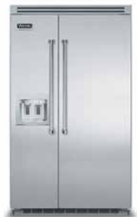
48"W. Side-by-Side with Dispenser