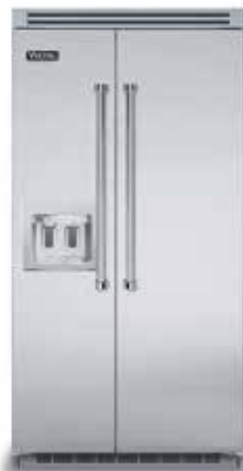
42"W. Side-by-Side with Dispenser