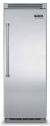
30"W. All Freezer