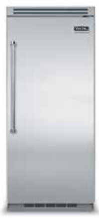
36"W. All Freezer