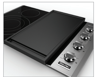
Optional Griddle Accessory