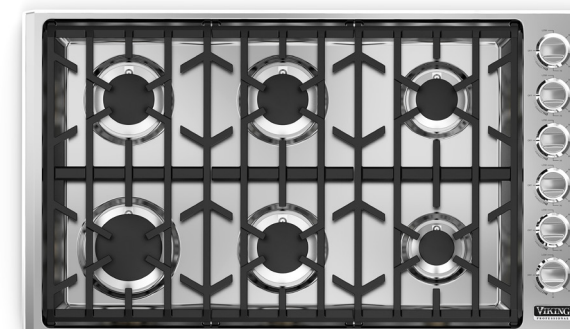
Gas Cooktops 30" and 36" Wide