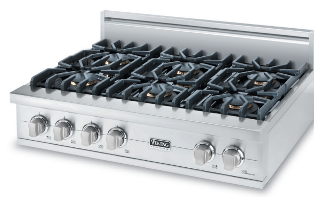
Gas Rangetops* 30", 36", and 48" Wide