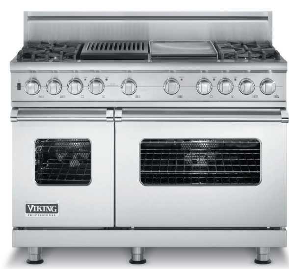
Dual Fuel Ranges* 30", 36", 48", and 60" Wide