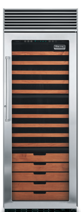
Built-In Wine Cellar, 30" Wide