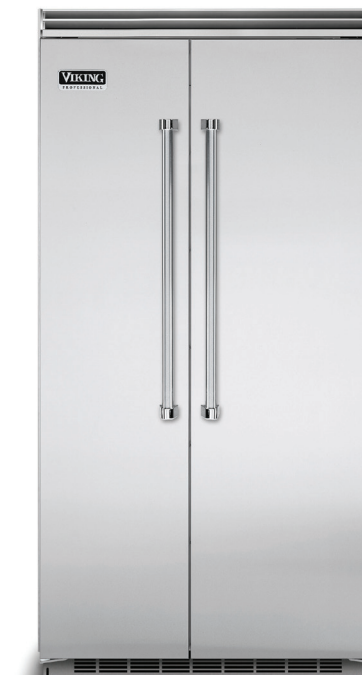
Built-In, Side-By-Side Refrigerator/Freezers, Custom Panel Models Available 42" Wide