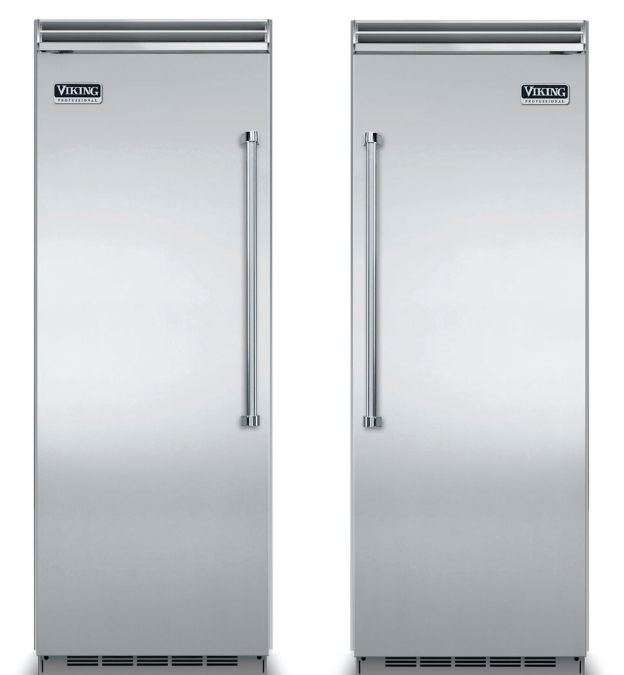
Built-In All-Refrigerators and All-Freezers, Custom Panel Models Available 30" and 36" Wide