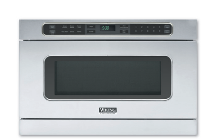
DrawerMicro™ Oven 24" Wide