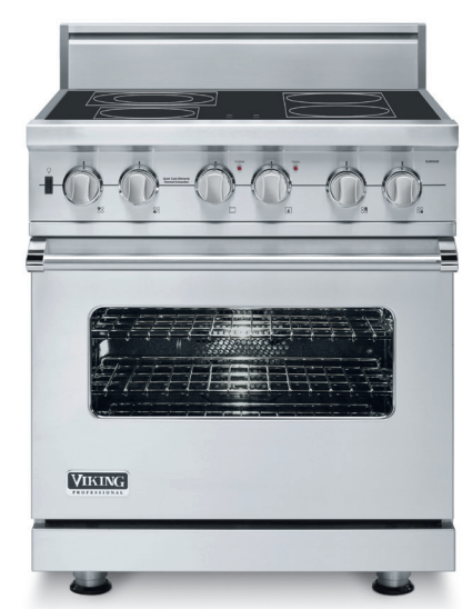
Electric and Induction Ranges* 30" Wide