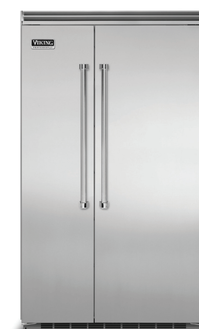
Built-In, Side-By-Side Refrigerator/Freezers, Custom Panel Models Available 48" Wide