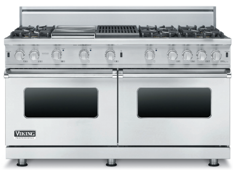
Gas Ranges* 30", 36", 48", and 60" Wide