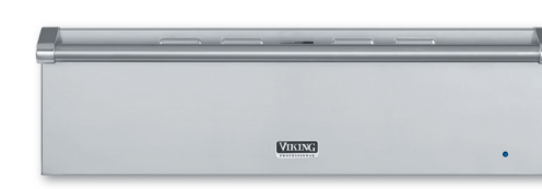
Electric Warming Drawers 27" and 30" Wide