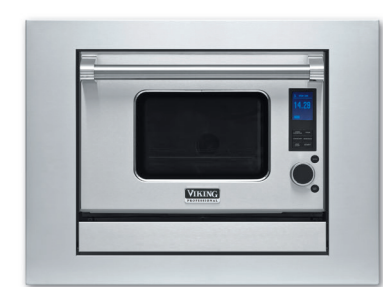
Combi-Steam/Convect™ Oven and Built-In Trim Kit Option 30" Wide