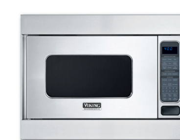
Microwave Ovens, Convection Microwave Ovens, Convection Microwave Hoods, and Built-In Trim Kit Options 27", 30", and 36" Wide