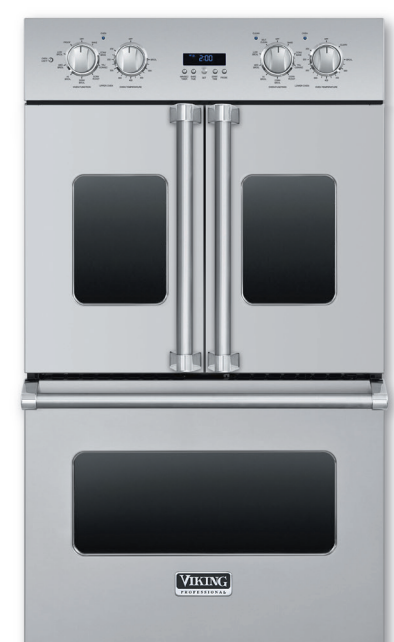
French-Door Single and Double Ovens 30" Wide