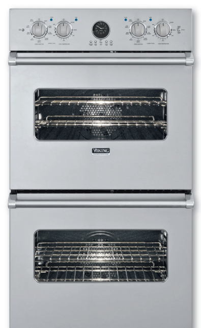
Electric Single and Double Ovens 27" and 30" Wide