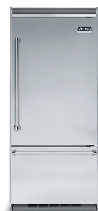
Built-In, Bottom-Freezer, Custom Panel Model Available 36" Wide