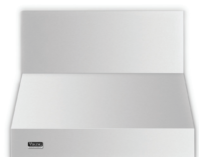
Wall Hoods 10", 12", and 18" High 30", 36", 42", 48", and 60" Wide