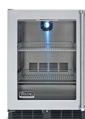
Undercounter/Freestanding Refrigerator 24" Wide