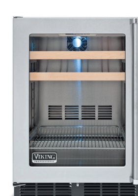
Undercounter/Freestanding Refrigerated Beverage Centers 15" and 24" Wide