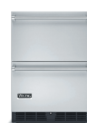
Undercounter/Freestanding Refrigerated Drawers 24" Wide