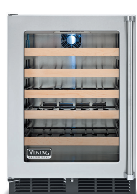
Undercounter/Freestanding Wine Cellars 15" and 24" Wide