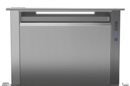
Rear Downdrafts 30", 36", and 48" Wide