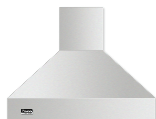
Chimney Wall Hoods 30", 36", 42", 48", and 60" Wide Chimney Island Hoods 36", 42", 54", and 66" Wide