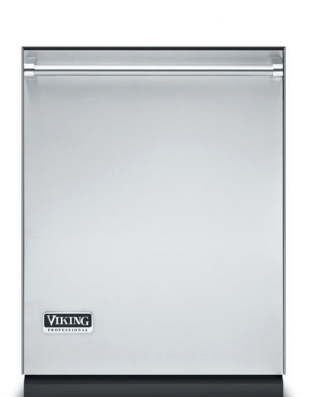
Dishwashers, Custom Panel Models Available 24" Wide