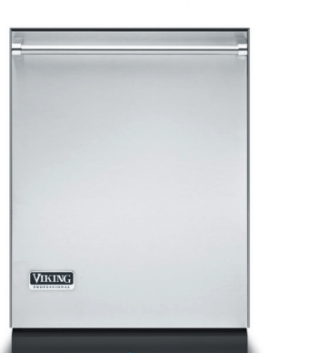
Dishwashers, Custom Panel Models Available 24" Wide