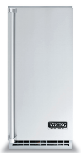
Undercounter/Freestanding Ice Machines 15" wide