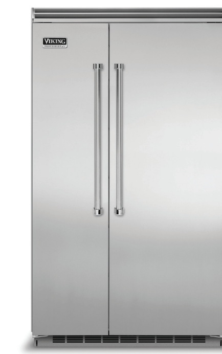
Built-In, Side-By-Side Refrigerator/Freezers, Custom Panel Models Available 48" Wide