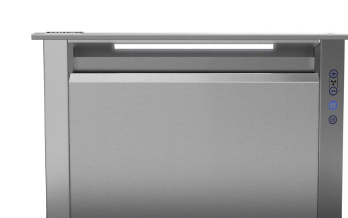
Downdrafts 30", 36" and 45" Wide