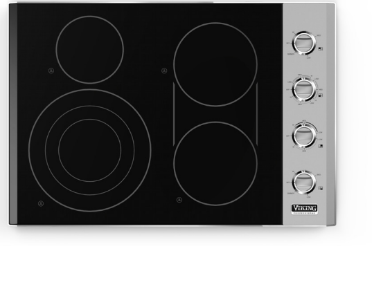
Electric Cooktops 30" and 36" Wide