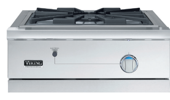
Outdoor Wok 24" wide