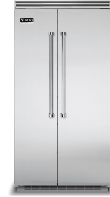
Built-In, Side-By-Side Refrigerator/Freezers, Custom Panel Models Available 42" Wide