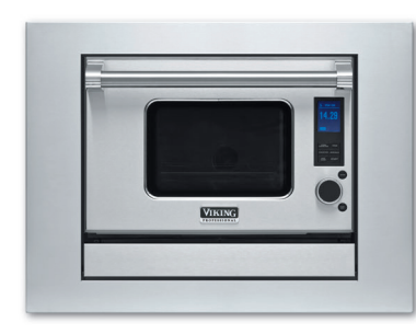
Combi-Steam/Convect™ Oven and Built-In Trim Kit Option 30" Wide