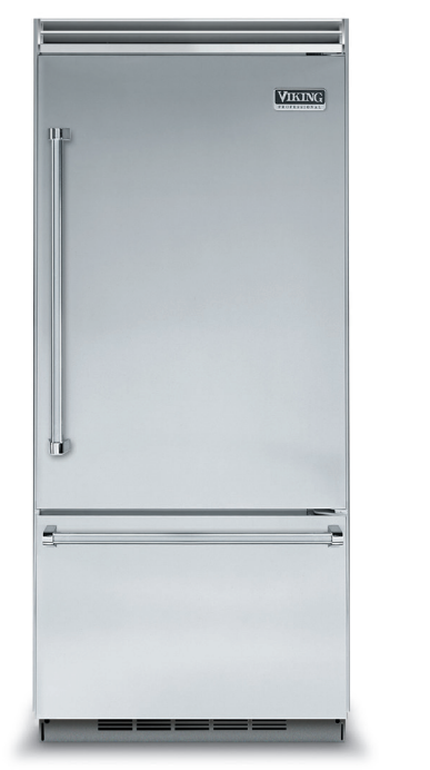
Built-In, Bottom-Freezer, Custom Panel Model Available 36" Wide