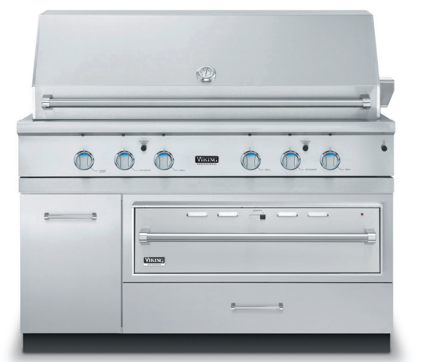
Stainless Steel Cabinetry