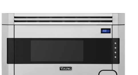
Conventional Microwave Hood 30" Wide