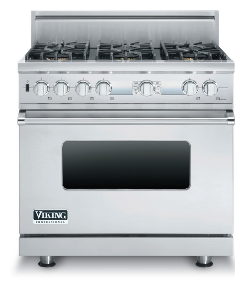
Dual Fuel Electronic Control Ranges* 30", 36", and 48" Wide