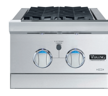
Built-In Side Burner 15" Wide