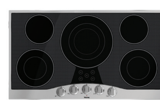
Electric Cooktops 30", 36", and 45" Wide