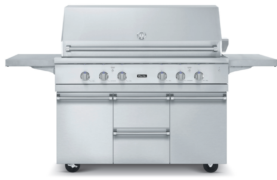
5 Series Ultra Premium Gas Grills 30", 36", 42", and 54" Wide Infrared Burner Option Available on 42" or 54" Wide (Cart optional; also available built-in)