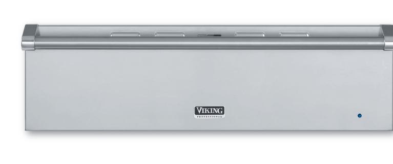
Built-In Warming Drawers 30", and 36" Wide