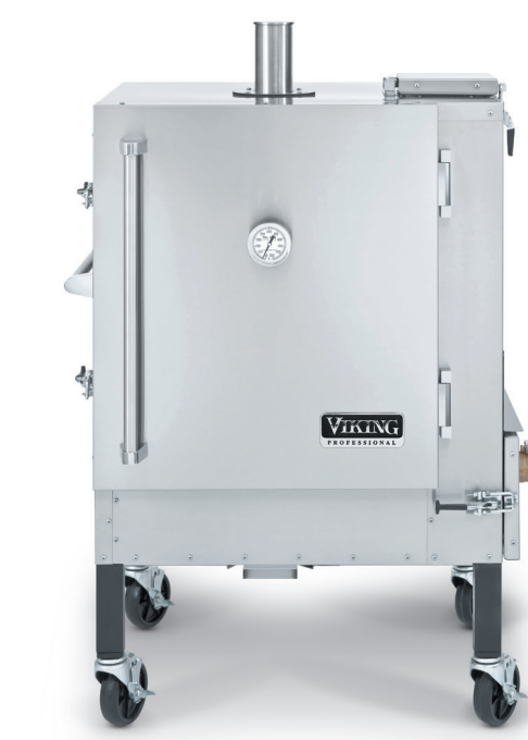
Gravity Feed Smokers 30" and 36" Wide