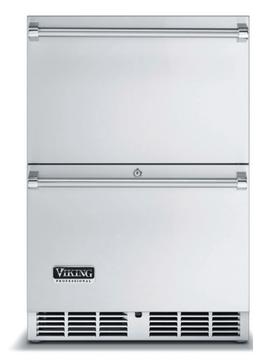
Undercounter/Freestanding Refrigerated Drawers 24" Wide