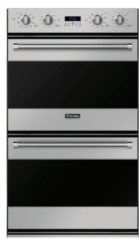
Electric Single and Double Ovens 30" Wide