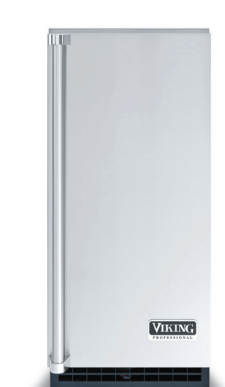
Undercounter/Freestanding Ice Machine, Custom Panel Model Available 15" Wide