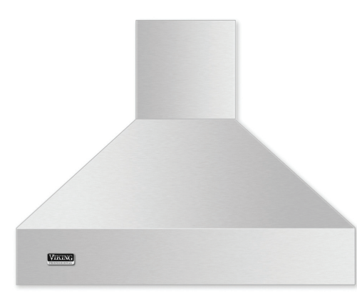
Chimney Wall Hoods 30", 36", 42", 48", and 60" Wide Chimney Island Hoods 36", 42", 54", and 66" Wide