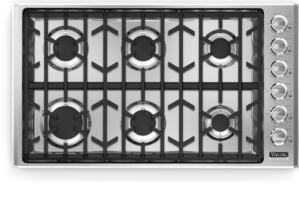
Gas Cooktops 30" and 36" Wide