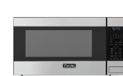
Conventional Microwave Oven (Built-in trim kit available)