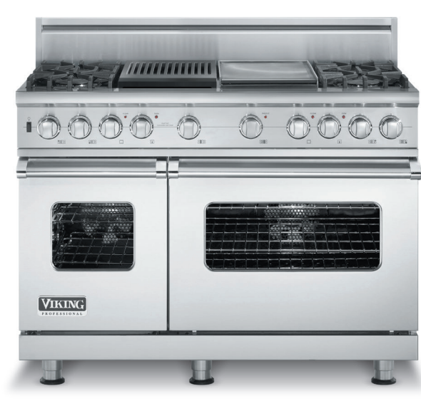
Dual Fuel Ranges* 30", 36", 48", and 60" Wide