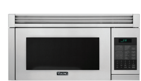
Convection Microwave Hood 30" Wide