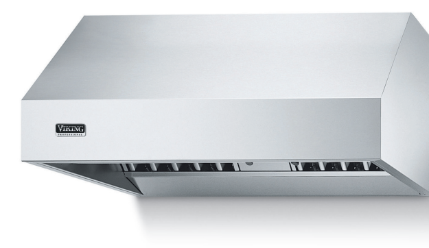
Built-In Wall Hoods 36", 48", and 60" Wide