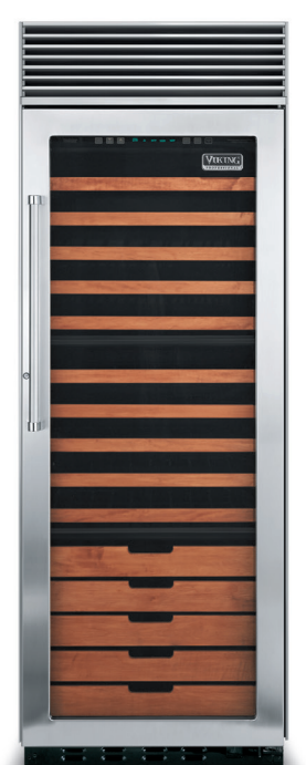
Built-In Wine Cellar, 30" Wide