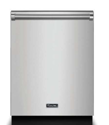
Dishwashers 24" Wide (Custom panel and water softener models available)