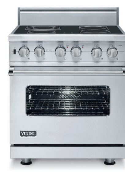
Electric and Induction Ranges* 30" Wide