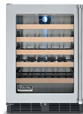
Undercounter/Freestanding Wine Cellars 15" and 24" Wide