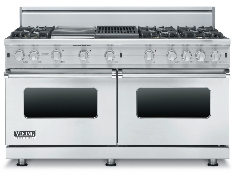
Gas and Gas Self-Clean Ranges* 30", 36", 48", and 60" Wide