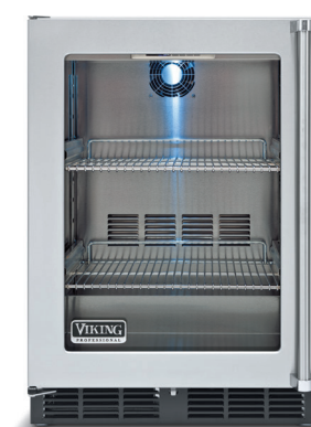
Undercounter/Freestanding Refrigerator 24" Wide