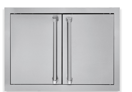
Built-In Access Doors 16" and 28" Wide