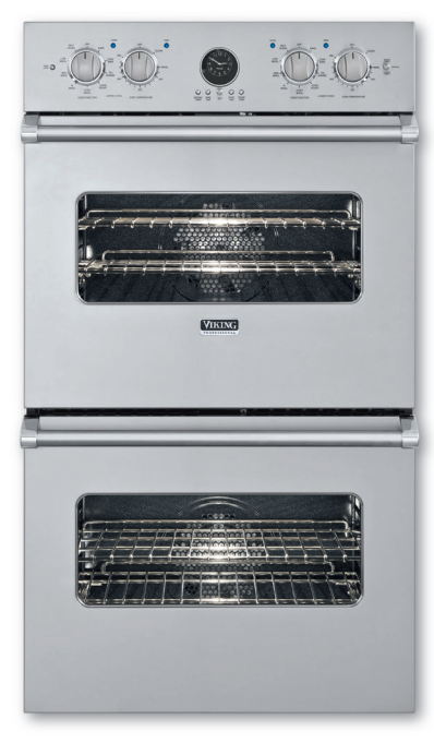
Electric Single and Double Ovens 27" and 30" Wide (also available with Touch Controls)