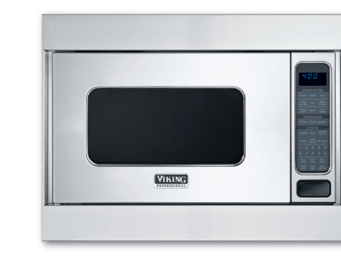
Microwave Ovens, Convection Microwave Ovens, Convection Microwave Hoods, and Built-In Trim Kit Options 27", 30", and 36" Wide