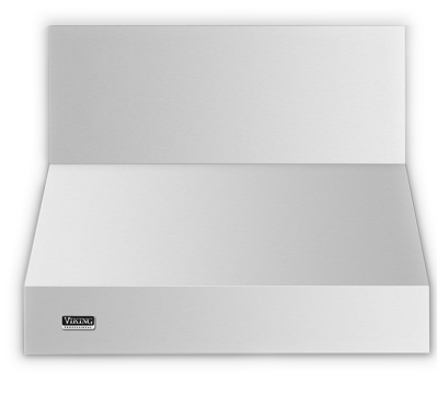
Wall Hoods 10", 12", and 18" High 30", 36", 42", 48", and 60" Wide