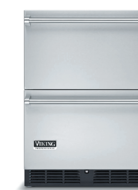
Undercounter/Freestanding Refrigerated Drawers 24" Wide