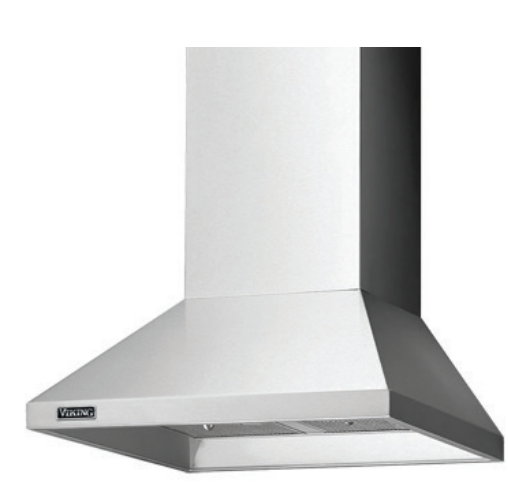
Chimney Wall Hoods 30" and 36" Wide