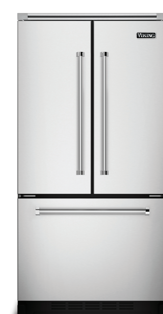
French-Door Bottom-Freezer 36" Wide