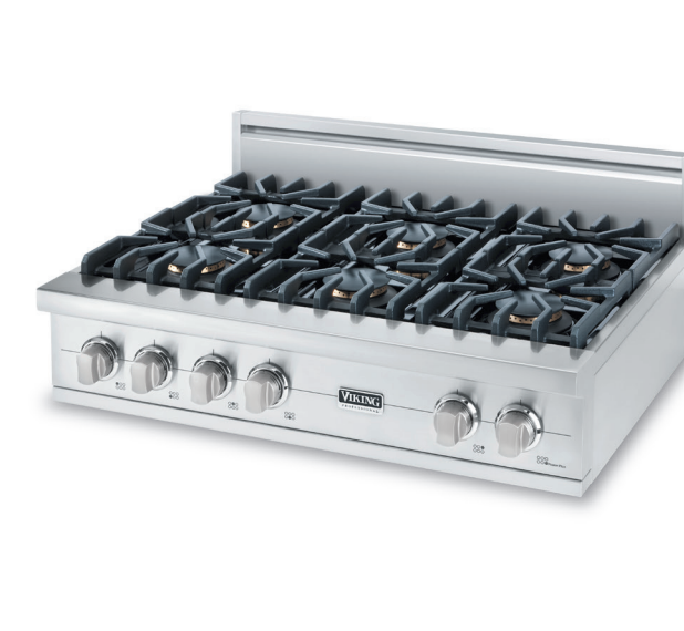
Gas Rangetops* 30", 36", and 48" Wide