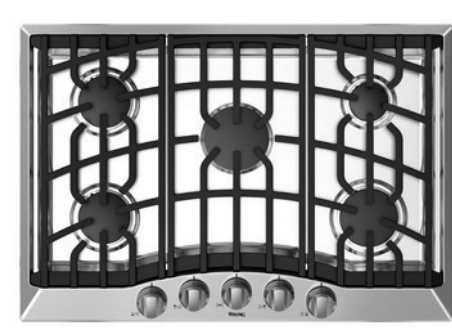
Gas Cooktops 30" and 36" Wide