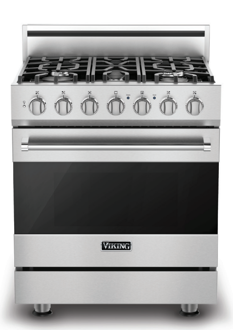
Gas, Dual Fuel, and Electric Self-Clean Ranges 30" Wide