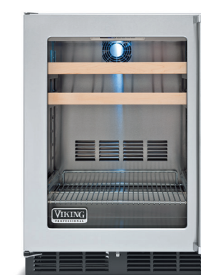
Undercounter/Freestanding Refrigerated Beverage Centers 15" and 24" Wide