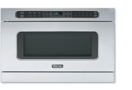
DrawerMicro™ Oven 24" Wide