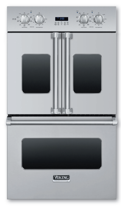
French-Door Double Oven 30" Wide