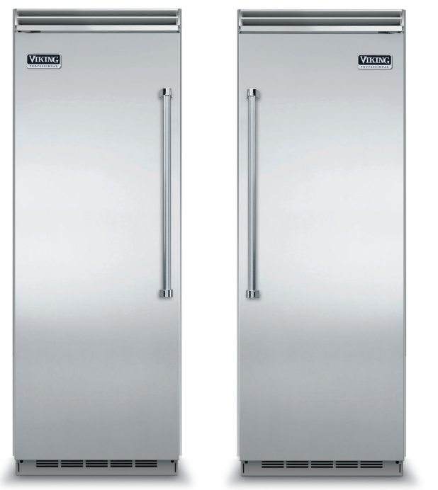
Built-In All-Refrigerators and All-Freezers, Custom Panel Models Available 30" and 36" Wide