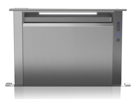
Rear Downdrafts 30", 36", and 48" Wide