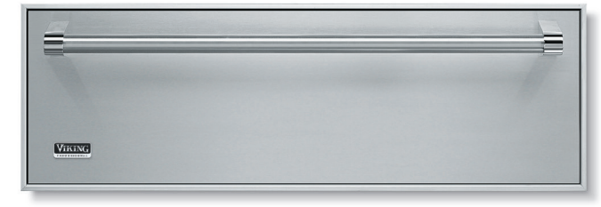
Built-In Storage Drawers 30" and 36" Wide