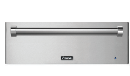
Warming Drawer 30" Wide