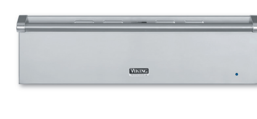
Electric Warming Drawers 27" and 30" Wide