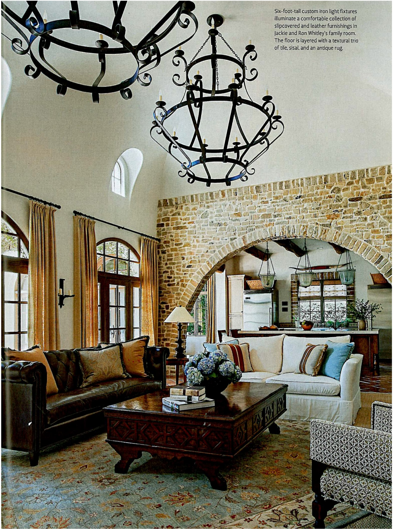
Six-foot-tall custom iron light fixtures illuminate a comfortable collection of slipcovered and leather furnishings in Jackie and Ron Whitley's family room. The floor is layered with a textural trio of tile, sisal, and an antique rug.