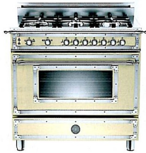
THE CLASSIC EUROPEAN-STYLE RANGE IS FROM THE HERITAGE SERIES BY BERTAZZONI. BERTAZZONI.COM.

12 Gray. This trendy color has made it to kitchen cabinetry; the trend is changing from gray with blue undertones to gray with brown undertones.