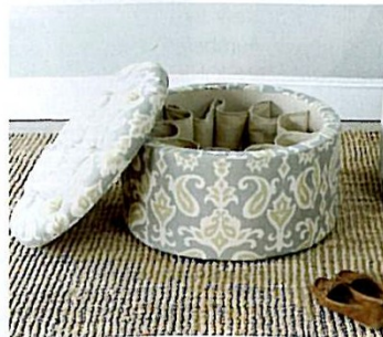
THE GRAY AND YELLOW OTTOMAN IS A STYLISH WAY TO STORE SMALL ITEMS.