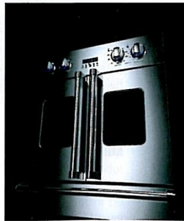
THE VIKING PROFESSIONAL FRENCH DOOR ELECTRIC OVEN HAS SIDE-SWING DOORS THAT ENHANCE ACCESSIBILITY. VIKINGRANGE.COM.

13 Appliance doubles. Television shows have elevated interest in cooking — and professional-style kitchens — so more homeowners are installing multiples, including two or three wall ovens and two dishwashers.