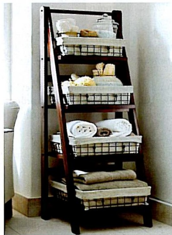
AN ÉTAGÈRE ADDS DECORATIVE STORAGE WITHOUT TAKING UP A LOT OF SPACE.