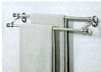
DOUBLE RODS CUT THE SPACE NEEDED TO HANG BATH TOWELS IN HALF.

■ Benches, cabinets, bins and hooks remain the easiest way to organize coats, shoes, hats and other accessories you'll need before heading outdoors.