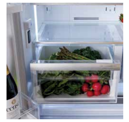
GREAT TASTE THAT LASTS

Meticulous temperature management and precise humidity control keeps fresh food fresher—for up to 30 days!