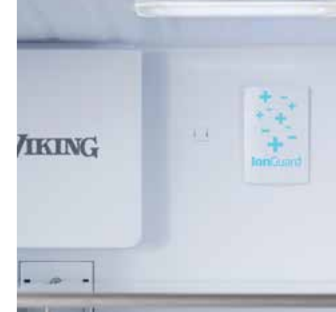
A BREATH OF FRESH AIR

Utilizes advanced ion technology to eliminate airborne bacteria, mold, and odors to enhance food preservation