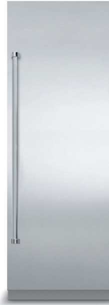
Shown with optional stainless steel door panel kit