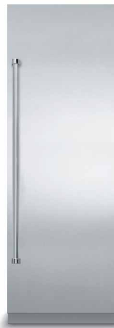
Shown with optional stainless steel door panel kit