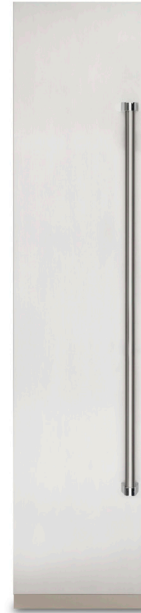
Shown with optional stainless steel door panel kit