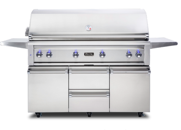
54"W. Freestanding Grill VQGFS5541