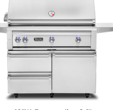
42"W. Freestanding Grill