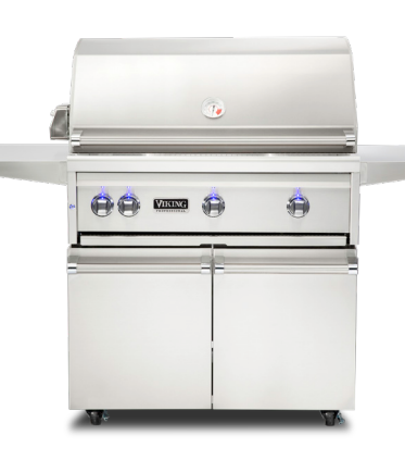
36"W. Freestanding Grill VQGFS5361