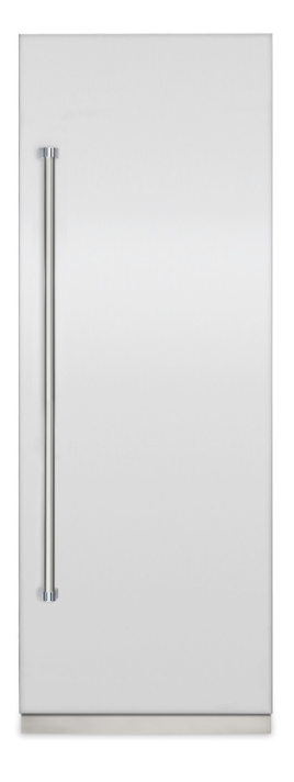
Shown with optional stainless steel door panel kit