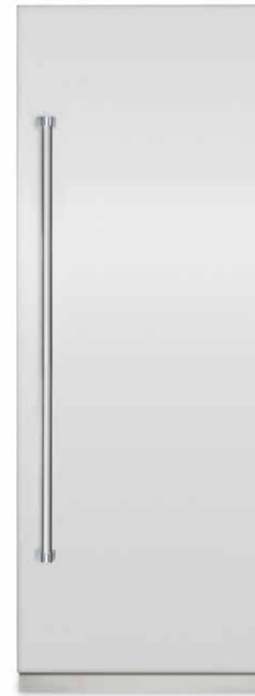
Shown with optional stainless steel door panel kit