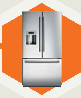
VitaFresh Bottom Mount Refrigeration by Bosch includes a technology that maintains optimal temperature and humidity levels to keep produce fresh. It also has LED lighting throughout and exterior controls. An Energy Star-qualified appliance. Bosch, from $3,499, bosch-home.ca