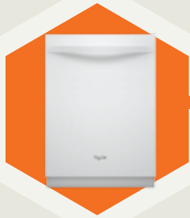
The Energy Star-qualified Whirlpool Gold Series Dishwasher with Sensor Cycle has an eco wash and dry cycle that cuts the amount of water and energy used in half. Whirlpool, $949, whirlpoolappliances.ca

Several kitchen appliances account for the biggest share of energy consumption in the home. So it makes sense to look at some new options to bring that energy bill down.