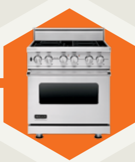
A new line of induction ranges by Brigade, formerly Viking Range, cooks food faster and minimizes the amount of heat in the kitchen, reducing energy use by about 20 percent. Professional Induction Range, Brigade, from $9,700, brigade.ca