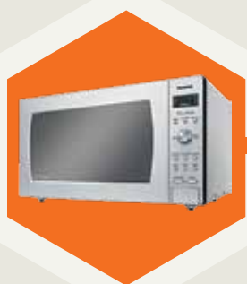
Panasonic Inverter Microwaves cook faster with less power output, up to 30 percent less than conventional models. Panasonic's NNSE992S Genius Prestige Plus Inverter Stainless Steel Microwave, $399, panasonic.ca