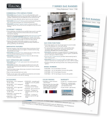
2-PAGE PRODUCT SPEC SHEETS Provides comprehensive features and specifications. VIKINGRANGE.COM PRODUCT PAGE

HOW TO CLAIM INCENTIVE { Submit copy of your quote, along with copy of the Dealer's invoice with the total amount claimed to spiffs@middlebyresidential.com ** }