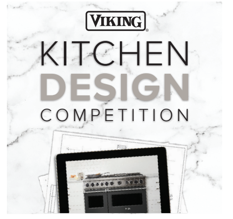
2021 VIKING DESIGN COMPETITION One Grand Prize Winner and Monthly Winners will receive global recognition and prizes. VIKINGRANGE.COM/DESIGNERS