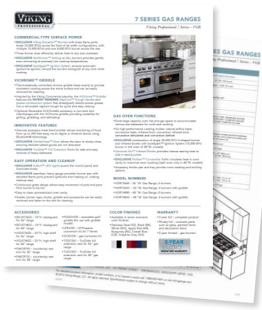
2-PAGE PRODUCT SPEC SHEETS Provides comprehensive features and specifications. VIKINGRANGE.COM PRODUCT PAGE