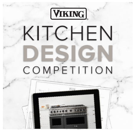
2021 VIKING DESIGN COMPETITION One Grand Prize Winner and Monthly Winners will receive global recognition and prizes. VIKINGRANGE.COM/DESIGNERS