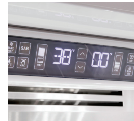
CAPACITIVE TOUCH CONTROLS