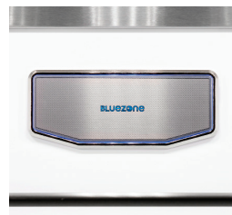
BLUEZONE® AIR PURIFICATION SYSTEM