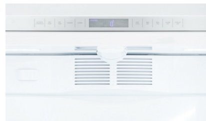
ELECTRONIC CONTROLS AND PLASMACLUSTER™