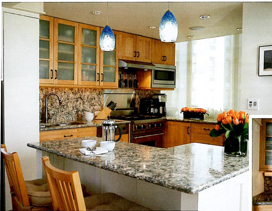
Solar shades on the windows keep the apartment from getting too hot or cold.