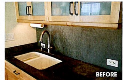
LEFT & BELOW: A light countertop, an inexpensive steel backsplash behind the range and a new sink and faucet brighten and update the kitchen.